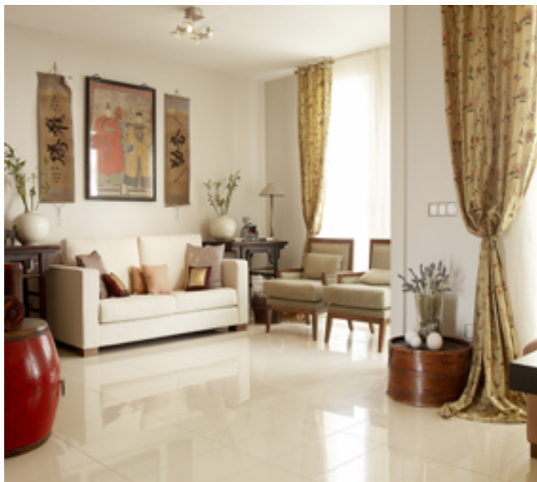
Figure 4 Installed product

The waste derived from the packaging of the pieces is managed separately according to the geographical location of the installation site. Otherwise, 3% of product losses have been considered at the installation stage.