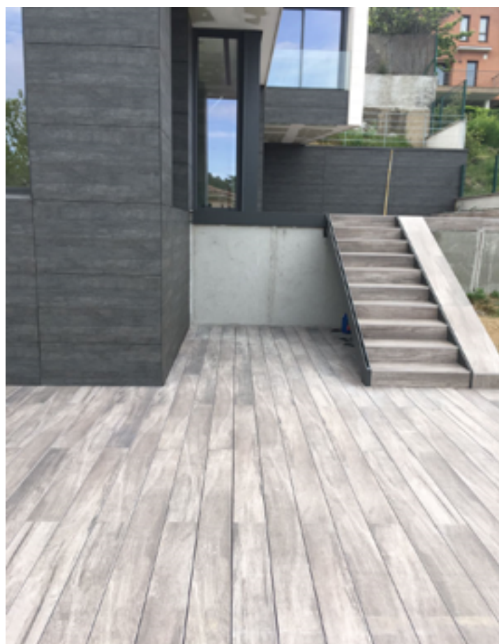
Figure 1 Installed product