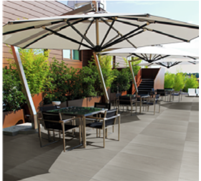
Figure 5 Installed product

The environmental burdens and benefits of obtaining secondary material from waste generated at the manufacturing stage (waste such as cardboard, plastic and wood), at the installation stage (tile waste, tile packaging waste: cardboard, plastic and wood) and at the end of life of the product have been considered.