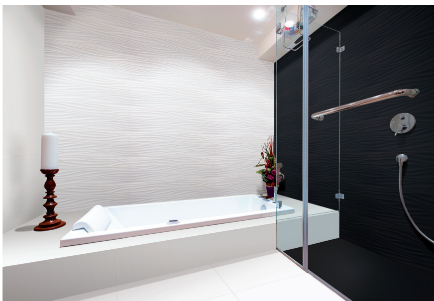
Figure 1 – Installed product

The Functional Unit is “1 m 2 covering of a surface (walls) with glazed ceramic tiles (BIII group) during 50 years”.