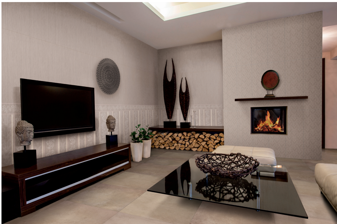
Figure 2 – Installed product

For further information regarding the project report of the LCA study for ceramic tiles manufactured by PORCELÁNICOS HDC, S.A. might be requested. To access this data, please contact the manufacturer: www.porcelanicoshdc.es hdc@porcelanicoshdc.es